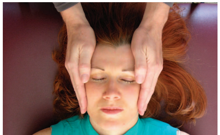
Head Position 2