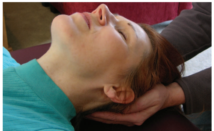
Head Position 4 - Optional