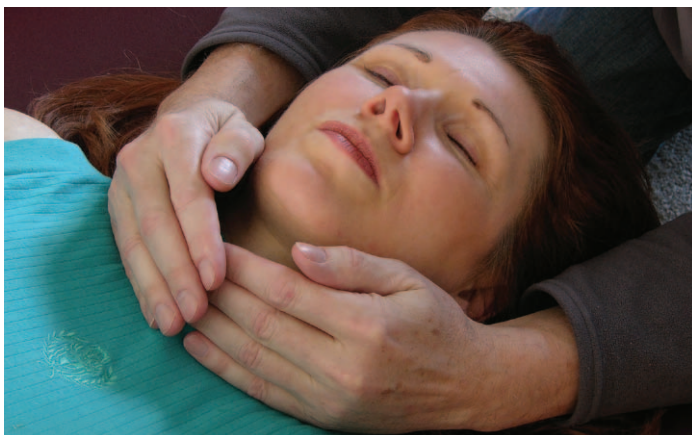
Head Position 3