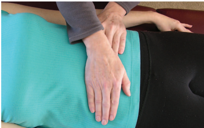
Torso Position 3