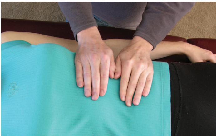
Torso Position 1