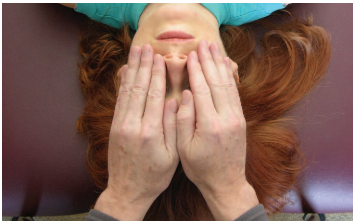
Head Position 1