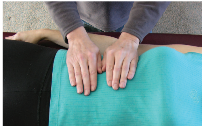
Torso Position 2